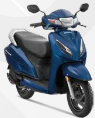
Decent Blue Metallic